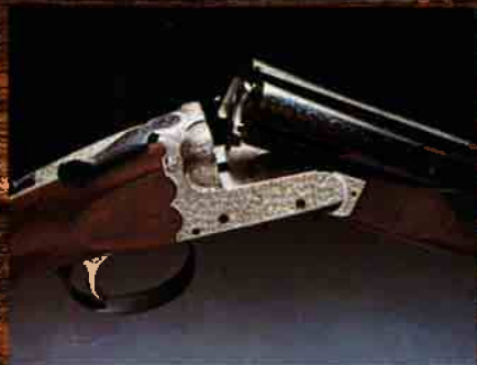
Model 300 Field

MODEL 400 FIELD GRADE. The top-of- the-line SKB Side-by-Side. A truly deluxe double gun. It has all the features of the 300 plus intricate scrollwork. Highly en- graved; engraving extends over a greater surface of the barrels. Full fancy French walnut stock and forend with extra fine hand-checkering.