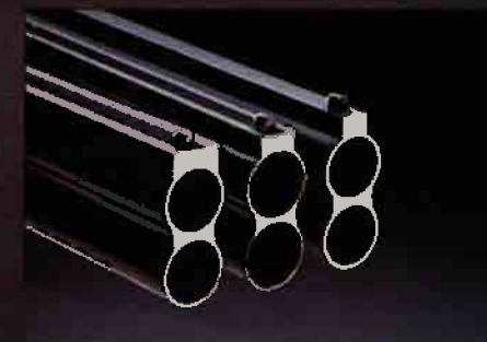
SKB Field and Target ribs, 7mm (field), 9mm, 12mm.