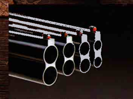
12, 20, 28, .410

The only small gauge over/under field guns made. Available in Models 500, 600. Your choice of gauges plus the rugged good looks of low profile frame. Quick pointing, light weight makes it the perfect all-day shooting partner.