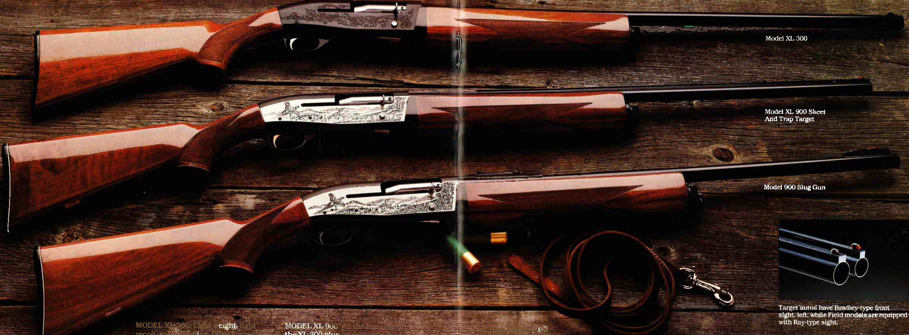
Model XL 300

both sides of the receiver. Target Model XL 900's have attractive scroll engraving on both sides of receiver. All models have reversible safety for left-handed shooters.