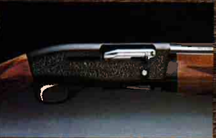
MODEL XL 900 SKEET AND TRAP TARGET. Quick pointing, perfect balance, deeply blued barrel. Receiver is intricately scrolled. Wider vent rib makes your swing and sighting smoother. Bradley-type front sight, middle bead. Gold-plated trigger and nameplate. White spacers at recoil pad, plus all the features of the XL 900.