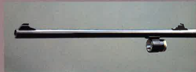
SKB SLUG BARREL

NEW SKB MAGAZINE CUT-OFF SYSTEM will make it simple to empty the chamber without unloading the magazine.