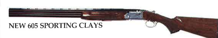
NEW 605 SPORTING CLAYS

Mastery of the newest clay target shooting sport is yours for the taking with SKB's newly designed sporting clays over-unders. Available in the 505 Deluxe, 605, and 885 models with 28" and 30" barrels and the inter-choke system, there's no course too tough. Changes in design for the new sporting clays gun include a wide stepped target style rib, sporting clays recoil pad, and sporting clays style stock dimensions.