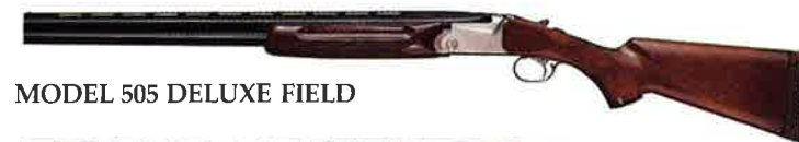
MODEL 505 DELUXE FIELD