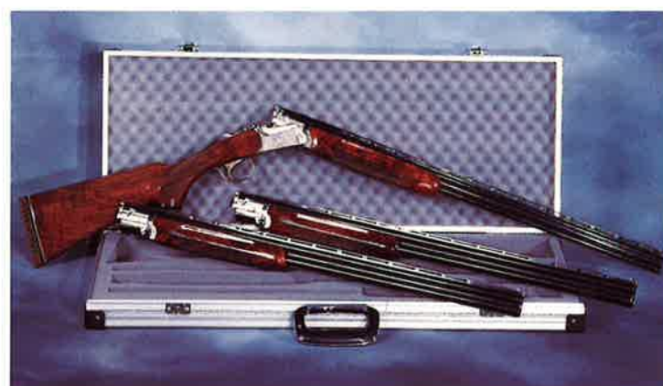
605 3-BARREL SKEET SET

Consistency in weight, balance and feel are trademarks of the SKB 3-barrel skeet set. The set is available in 20, 28 and .410 ga. in the 505 Deluxe, 605 and 885 models. A forend comes with each barrel and all fit smoothly on the same action. A fitted aluminum case is included to protect your shooting investment.