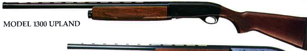
MODEL 1300 UPLAND