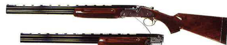
MODEL 885 FIELD SET

The ultimate in versatility in the field! SKB field two-barrel sets are available in 12 and 20 ga. or 28 and .410 ga. You have your choice of all three grades: 505 Deluxe, 605, and 885, and all of the features. Now you can enjoy shooting two gauges with the fit and feel of one gun.