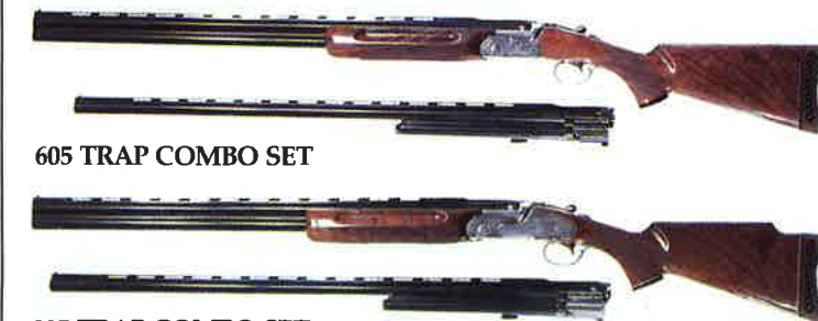
605 TRAP COMBO SET