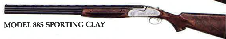
MODEL 885 SPORTING CLAY