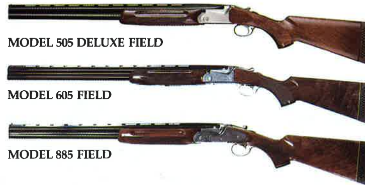
MODEL 505 DELUXE FIELD