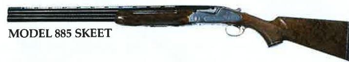
MODEL 885 SKEET