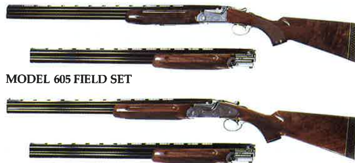
MODEL 605 FIELD SET