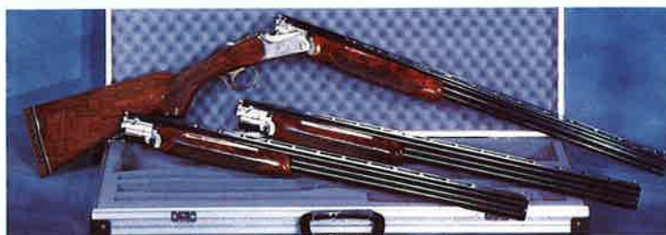
MODEL 605 3-BARREL SKEET SET