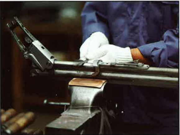
Once the initial phase is completed by the computer operated milling machines, the master gunsmiths begin their work of fitting, assembling and polishing the critical components of the receiver, barrel group and forend iron. The engraving is then rolled onto the polished metal prior to hardening and final finish.

STOCK DIMENSIONS Length of Pull - 13 1/2" Drop at Comb - 1 1/2" Drop at Heel - 2 1/4" MFB - Metal Front Bead