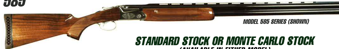
MODEL 585 SERIES (SHOWN)

STANDARD STOCK OR MONTE CARLO STOCK (AVAILABLE IN EITHER MODEL)