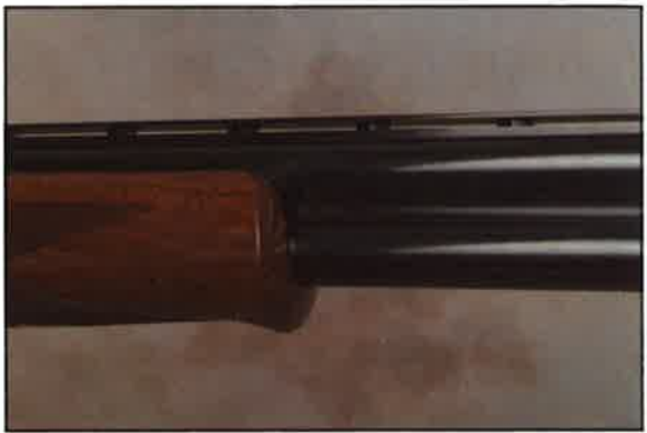
New Schnabel Forend is standard on the Upland Models and the 505 Sporting Clay Models.

STOCK DIMENSIONS Length of Pull - 14 1/8" Drop at Comb - 1 1/2" Drop at Heel - 2 3/16" MFB - Metal Front Bead