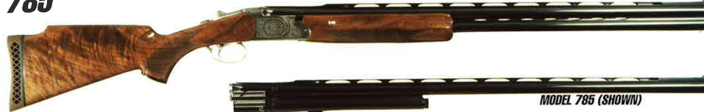
MODEL 785 (SHOWN)