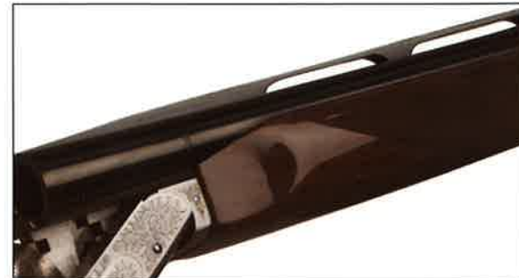
485 Series Raised Ventilated Rib

The 385 Series is also offered as a two barrel set, with 20ga/26" & 28ga/26" barrels.