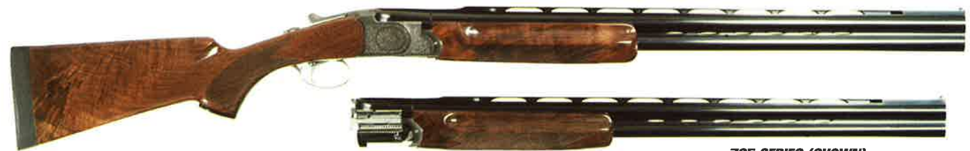
785 SERIES (SHOWN)