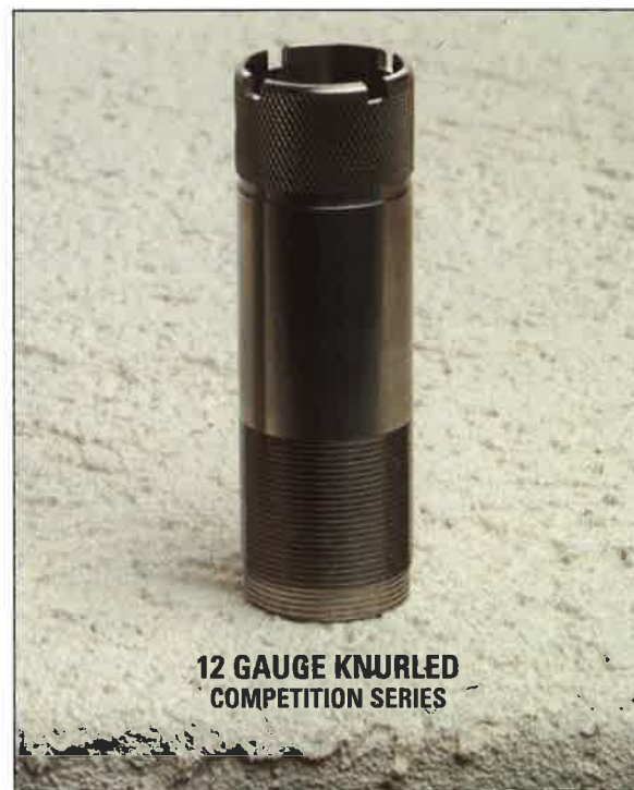
12 GAUGE KNURLED COMPETITION SERIES

The new stainless extended tubes are designed for the 12 gauge "Backbored Barrels". Backbored Barrels and a longer choke taper produce more uniform pellet pattern densities. The "knurled" choke tube allows the shooter a quick and effective means to adjust the pellet pattern for the target being presented.