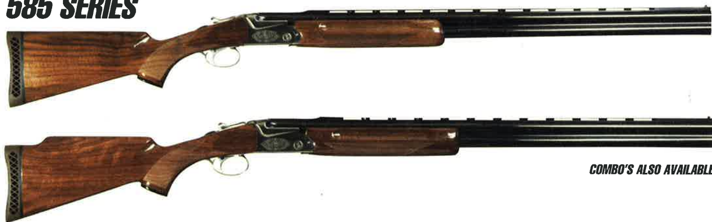
COMBO'S ALSO AVAILABLE