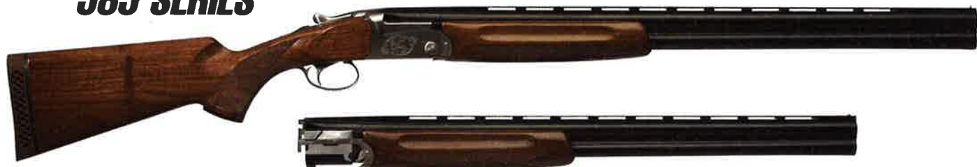
(12 GA. & 20 GA. SET SHOWN)