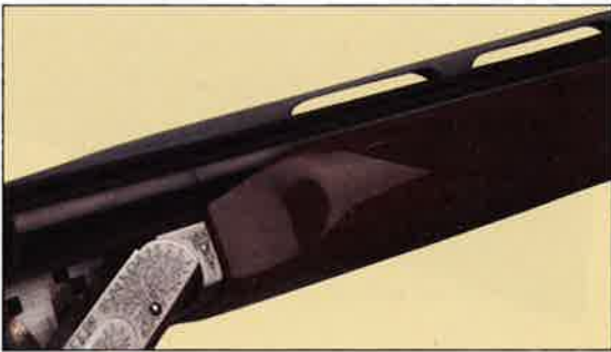
Raised Ventilatted Rib

The side plated box lock action of the 485 Series features two beautifully engraved Upland game scenes. The 485 Barrel group is fitted with a distinctive raised ventilated rib with a flat matte finish. The 385 Series features a traditional low profile box lock action and solid rib with a matte finish. The 385 Series is available in several configurations: the Field Model, the Two Barrel Field Set (20ga. and 28ga.), and the Sporting Clay Model.