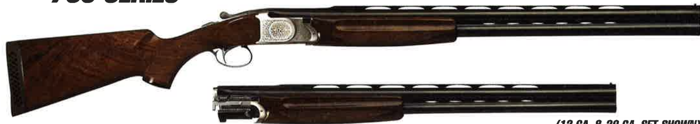
(12 GA. & 20 GA. SET SHOWN)