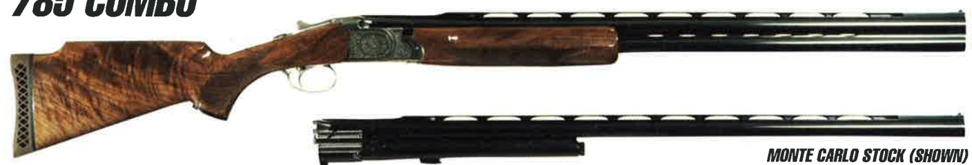
MONTE CARLO STOCK (SHOWN)

CHAMBER, EJECTORS AND BORES ARE CHROME PLATED ON ALL 785 MODELS