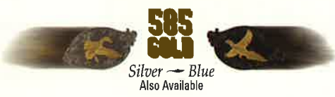
585 GOLD Silver — Blue Also Available

The 2 Barrel Field Set provides the hunter with a choice of gauges to use. This versatility allows one to assess the hunting conditions or the type of game being hunted then choose the most appropriate gauge. This is done without sacrificing the "fit & feel" of the shotgun. Most hunters agree that their favorite shotgun "just fits them well". The SKB Field Set gives you that same confidence but with the added advantage of choosing a smaller gauge.