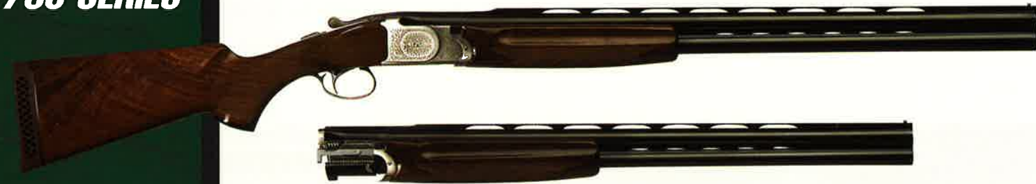
(12 GA. & 20 GA. SET SHOWN)