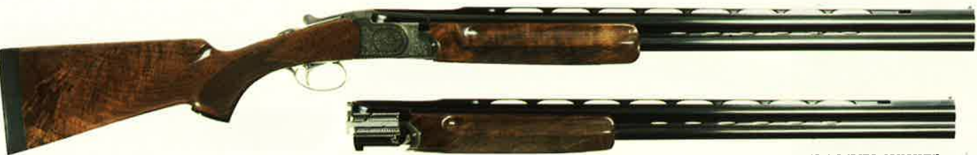
785 SERIES (SHOWN)