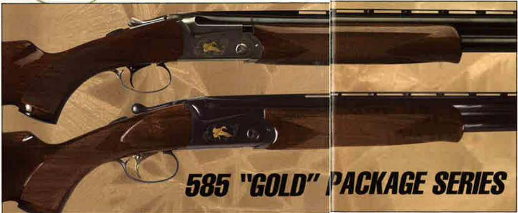
Features: Gold plated trigger, 2 gold plated game scenes and a hand finished schnabel forend.