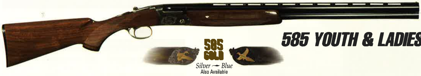
585 YOUTH & LADIES

The new "Youth and Ladies" model 585 Field takes into consideration the shorter arm reach of these individuals by featuring a shorter 13 1/2 inch length of pull. This new stock dimension gives these shooters a natural quick pointing fit, which is well balanced for good swing control. The 12 gauge models incorporate all the '85 Series standard features: oversize bores, lengthened forcing cones and competition series choke tubes.