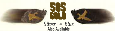
585 GOLD Silver — Blue Also Available