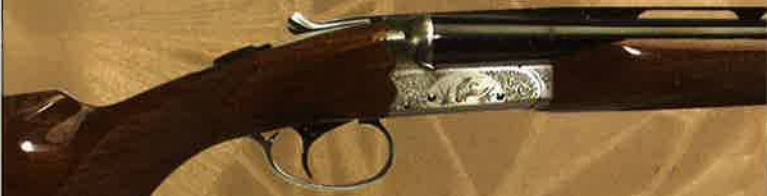
NEW 20 ga. & 28 ga. Models