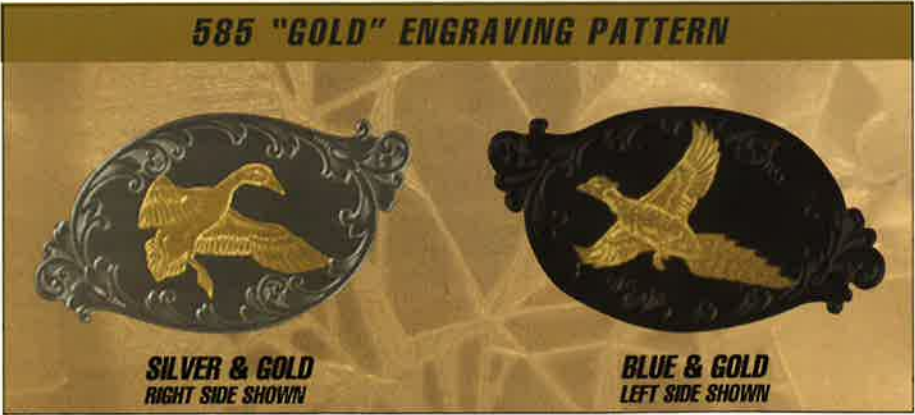
Choice of receiver finish on 585 Gold Traditional Blue or Silver Nitrite.