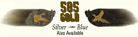
585 GOLD Silver — Blue Also Available

Sporting Clays is a challenge to every sportsman who has ever shot a course; where targets move in every conceivable direction. Mastering this sport requires more than concentration and instinct. It requires a shotgun with responsive fit, balance and a fast sighting plane.