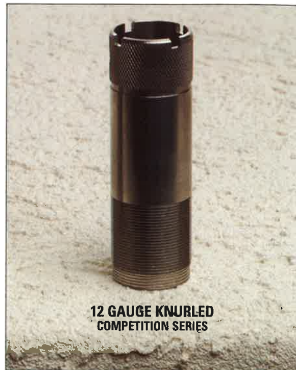
12 GAUGE KNURLED COMPETITION SERIES

The new stainless extended tubes are designed for the 12 gauge "Backbored Barrels". Backbored Barrels and a longer choke taper produce more uniform pellet pattern densities. The "knurled" choke tube allows the shooter a quick and effective means to adjust the pellet pattern for the target being presented.