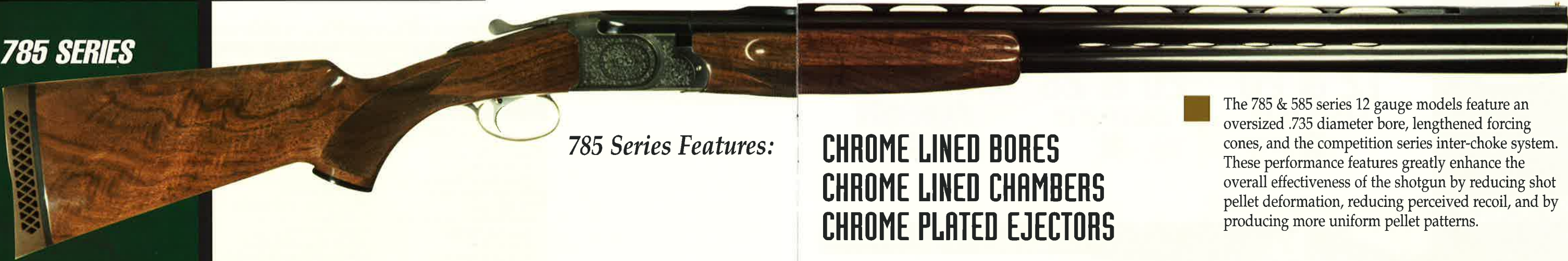
785 Series Features:

CHROME LINED BORES CHROME LINED CHAMBERS CHROME PLATED EJECTORS