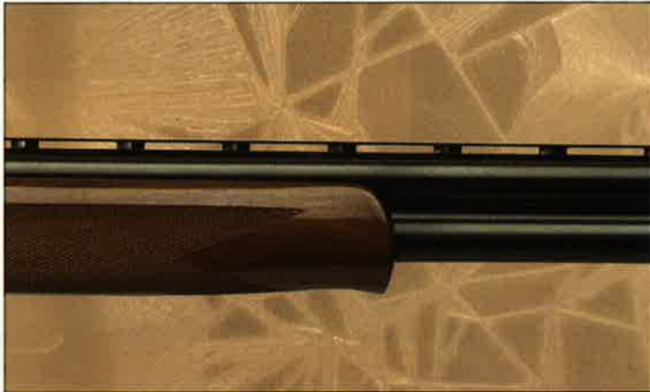
The Schnabel Forend is standard on the Upland Models, the 505 Sporting Clay Models, and the 585 "Gold Package."