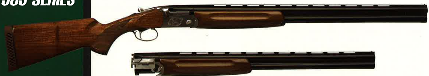
(12 GA. & 20 GA. SET SHOWN)