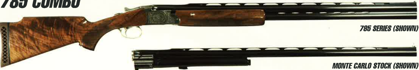
785 SERIES (SHOWN)

Performance Tuned: OVERSIZED DIAMETER BORES LENGTHENED FORCING CONES COMPETITION SERIES CHOKE TUBES