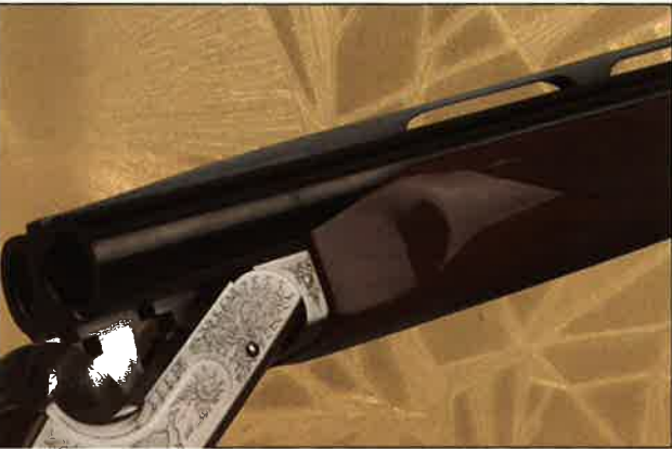
Raised Ventilatted Rib

STOCK DIMENSIONS Length of Pull - 14 1/4" Drop at Comb - 1 7/16" Drop at Heel - 1 7/8"