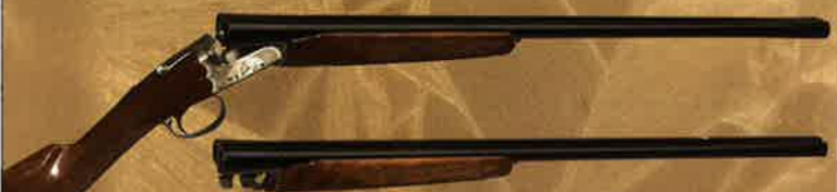
26" or 28" Barrels Pistol Grip or English Stock

The SKB Side By Side Shotgun features a low profile box lock action with double locking lugs designed to provide years of dependable service. The silver nitrided receiver is embellished with finely engraved game scenes and scroll designs. Enhanced performance features of the SKB Side by Side include; a single selective trigger, automatic safety, selective automatic ejectors, inter-choke tubed barrels and lengthened forcing cones.