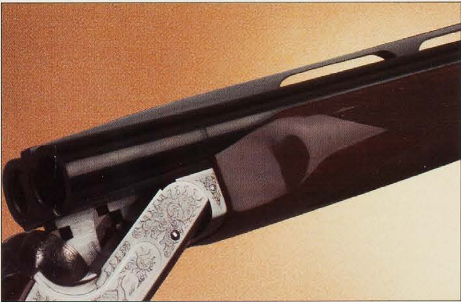
Raised Ventilatted Rib

STOCK DIMENSIONS Length of Pull - 14 1/4" Drop at Comb - 1 1/2" Drop at Heel - 1 7/8"