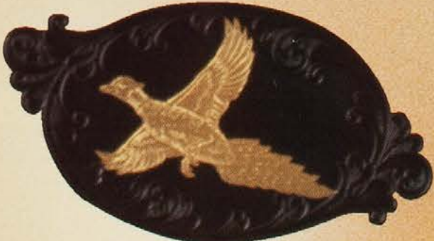
BLUE & GOLD LEFT SIDE SHOWN

Choice of receiver finish on 585 Gold Traditional Blue or Silver Nitrite.