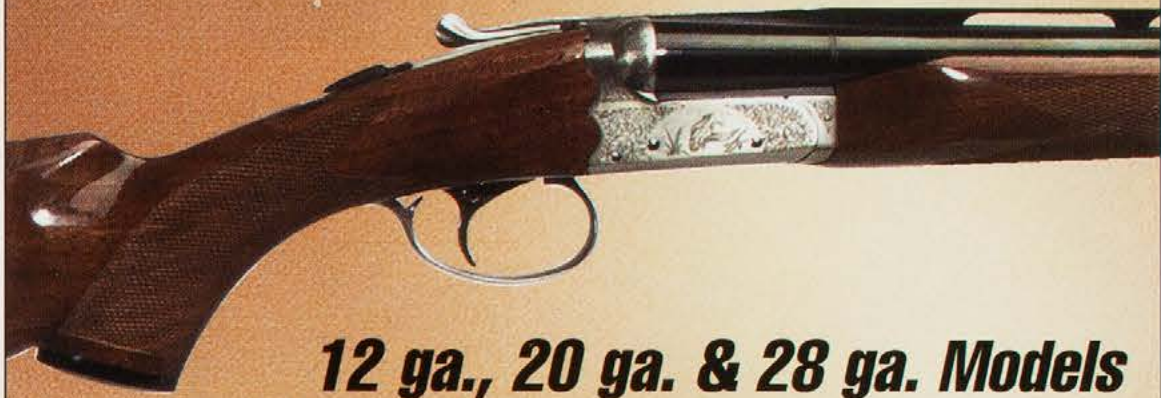
12 ga., 20 ga. & 28 ga. Models