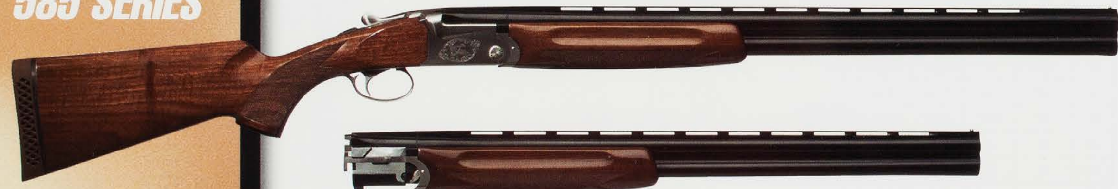
(12 GA. & 20 GA. SET SHOWN)