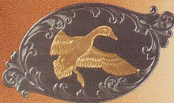
SILVER & GOLD RIGHT SIDE SHOWN