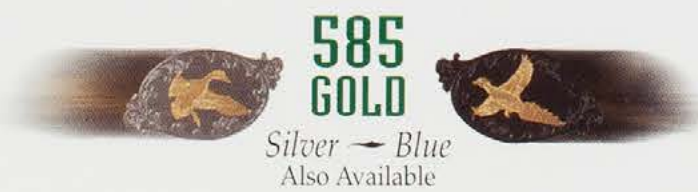
585 GOLD Silver — Blue Also Available