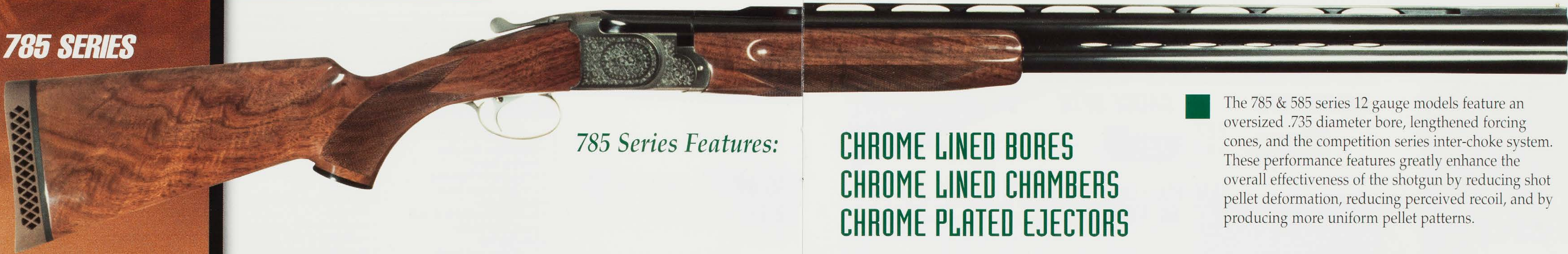
785 Series Features:

CHROME LINED BORES CHROME LINED CHAMBERS CHROME PLATED EJECTORS