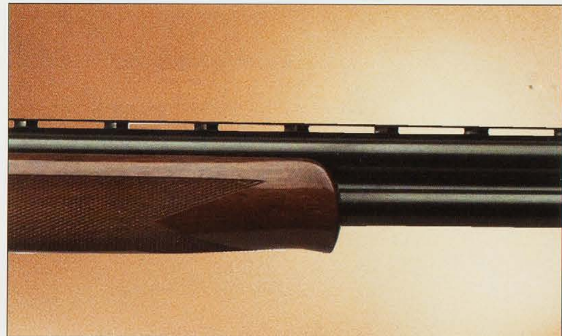
The Schnabel Forend is standard on the Upland Models, the 505 Sporting Clay Models, and the 585 "Gold Package."

STOCK DIMENSIONS Length of Pull - 14 1/8" Drop at Comb - 1 1/2" Drop at Heel - 2 1/2" 1 MFB - Metal Front Bead