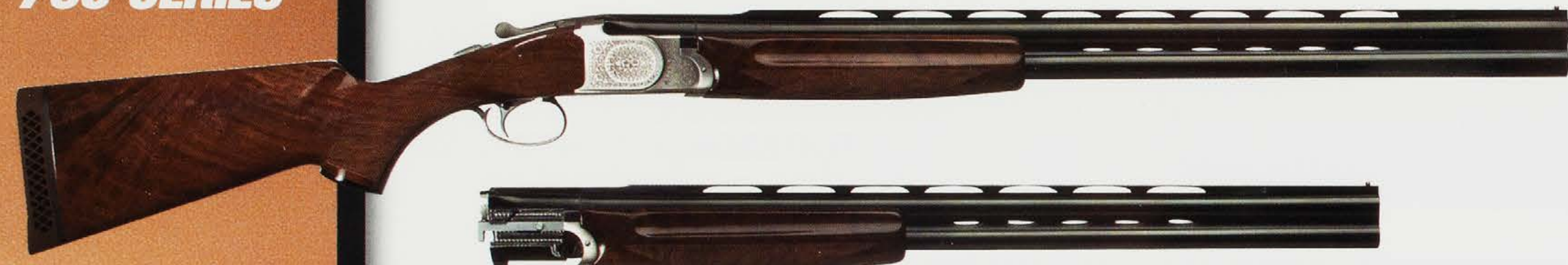
(12 GA. & 20 GA. SET SHOWN)