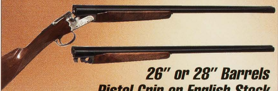
26" or 28" Barrels Pistol Grip or English Stock

The SKB Side By Side Shotgun features a low profile box lock action with double locking lugs designed to provide years of dependable service. The silver nitrided receiver is embellished with finely engraved game scenes and scroll designs. Enhanced performance features of the SKB Side by Side include; a single selective trigger, automatic safety, selective automatic ejectors, inter-choke tubed barrels and lengthened forcing cones.