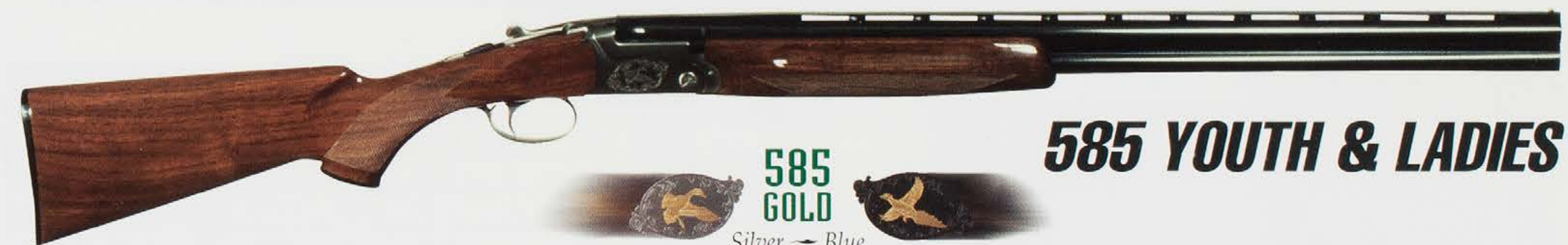
585 YOUTH & LADIES