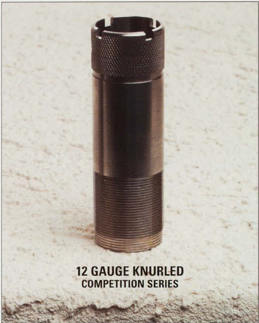
12 GAUGE KNURLED COMPETITION SERIES

The new stainless extended tubes are designed for the 12 gauge "Backbored Barrels". Backbored Barrels and a longer choke taper produce more uniform pellet pattern densities. The "knurled" choke tube allows the shooter a quick and effective means to adjust the pellet pattern for the target being presented.