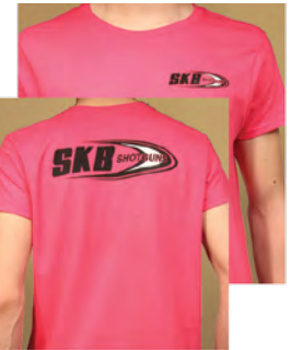
Pink (Ladies Cut) Sizes: XS, S, M, L, XL, 2XL, 3XL