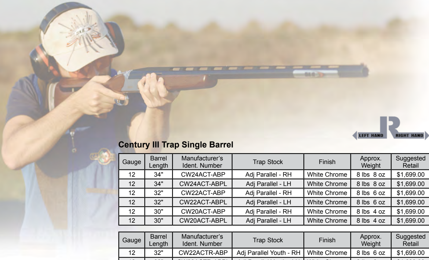
Century III Trap Single Barrel