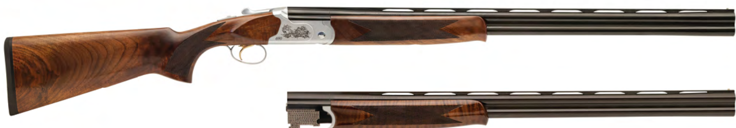
Small frame 28 and 410 multi-gauge sets available in 28" and 26" barrels.

The chrome lined barrels have 3" chambers (except 28ga. - 2 3/4") with lengthened forcing cones to reduce felt recoil and muzzle lift. The barrels are equipped with automatic ejectors and are fitted with an internal choke tube system. The exterior of the barrel group is highly polished then hot blued resulting in a deep luster finish.