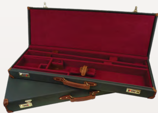
2BBL Field HC-FLD2BBL

These hard cases are sturdy wood construction, covered with a water resistant polyester canvas, lined with a wool felt, fitted with a solid handle and two combination locks.