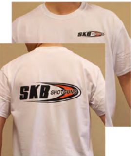
White (Men's Cut) Sizes: S, M, L, XL, 2XL, 3XL