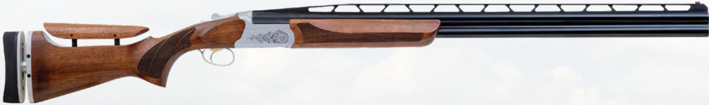
90HTR HIGH TRAP RIB