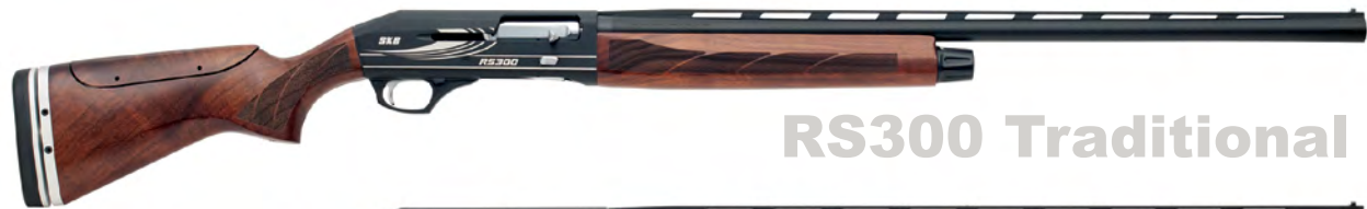
RS300 Traditional Comb