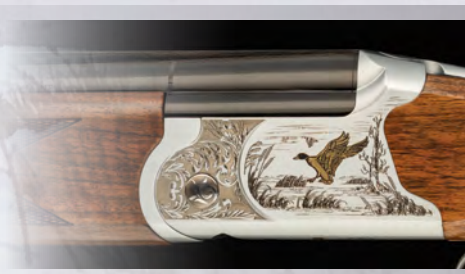
12 & 20 ga