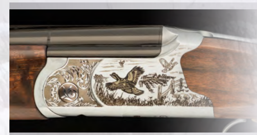
28 & 410 ga