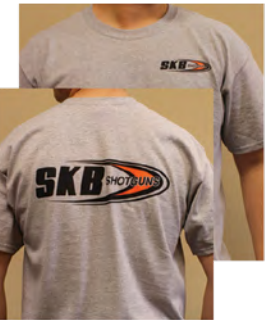
Gray (Men's Cut) Sizes: S, M, L, XL, 2XL, 3XL