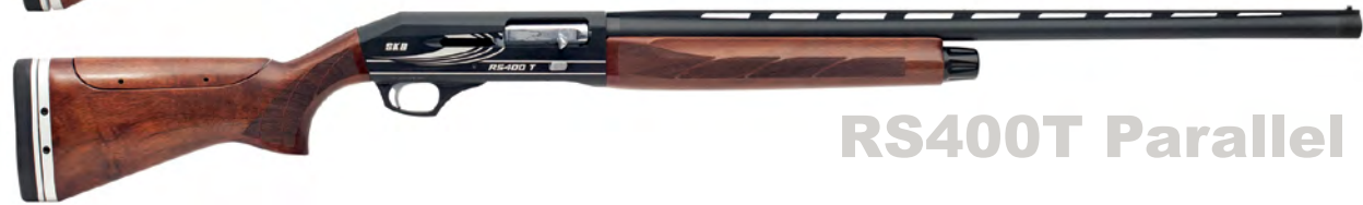
RS400T Parallel Comb

A properly fit shotgun stock is a combination of adjustments. These adjustments are unique to each individual shooter and include the drop dimensions, the proper length of pull, pad rotation and the comb alignment and height. The “fit and feel” of a shotgun and where it patterns are all dependent upon these unique dimensions.